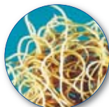
Toxocara canis roundworms

The choice of products can be bewildering, so please ask us to advise you on the best treatment regime for your pet!